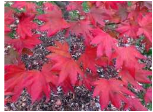
Views of Autumn from the south coast.