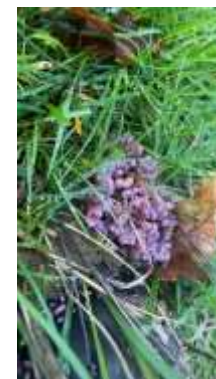
Two types of Coral Fungus.