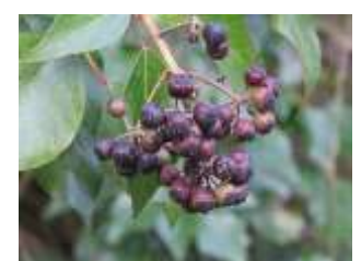
Ivy in all its glorious forms

'For the love of Ivy'...we aren't the only ones...remember the Mamas and Papas? For The Love Of Ivy - YouTube (guess not written about the Hedera helix though 😊)