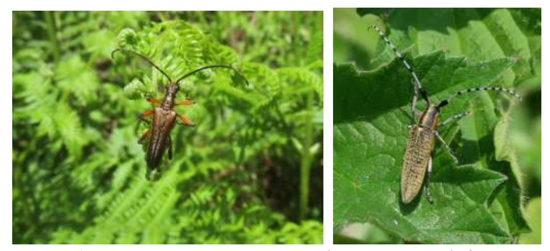
Longhorn beetles are so exquisite - a couple of species you may find on your travels