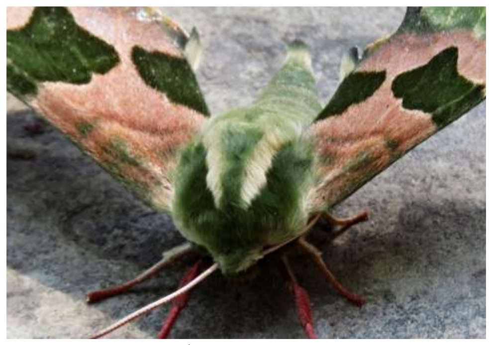
Stunning photo of a Lime Hawk-moth

We led four short walks on a green space at the heart of Manningtree. A very hot day, with little insect life, but the grasses and wild flowers were a joy to behold.