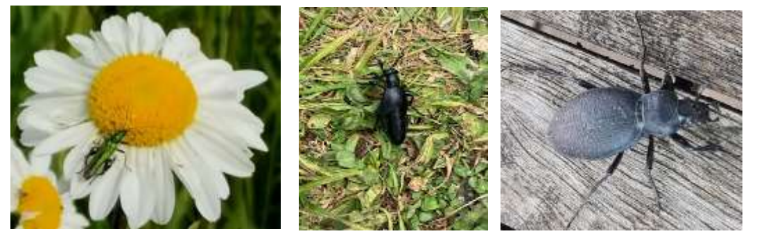
Three beetles – the 'thick thigh' feasting in a daisy, a kind of oil beetle out walking plus a Carabus ground beetle sunning himself in beautiful Bavaria

Hornet dropping in for his daily drink in a local pond. Such beautiful and misunderstood creatures. Usually non-aggressive unless provoked or if nest is threatened