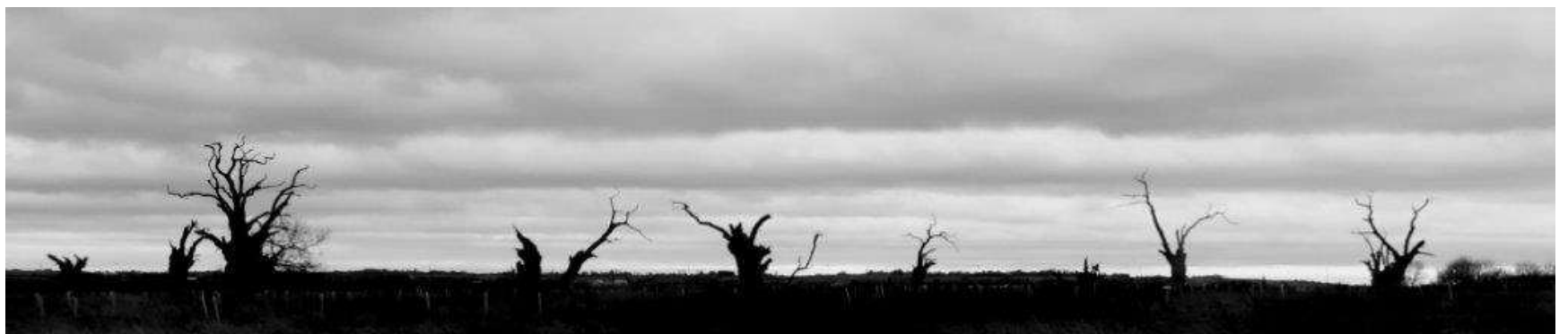
The Mandon Oaks - chilling eh?