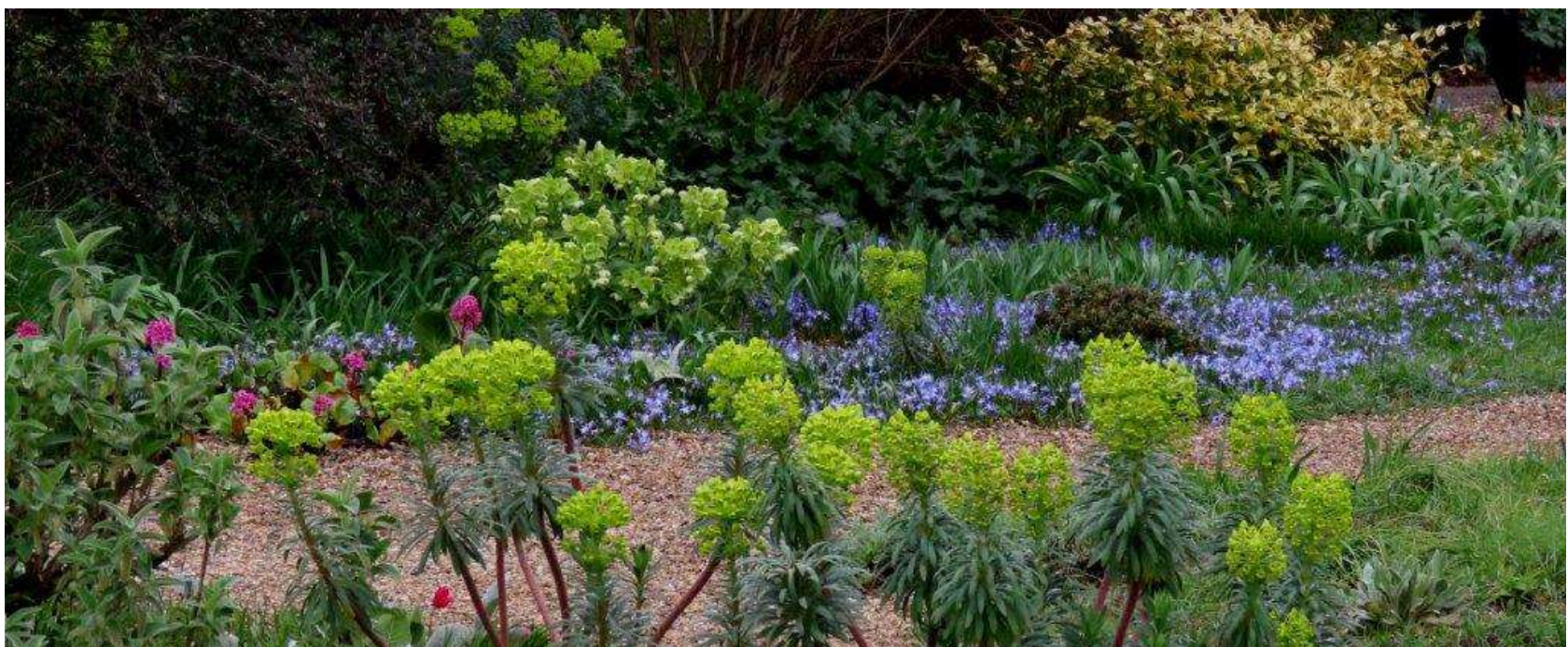
Beth Chatto's Dry Garden

Facebook Wild Essex -Bringing Nature to You