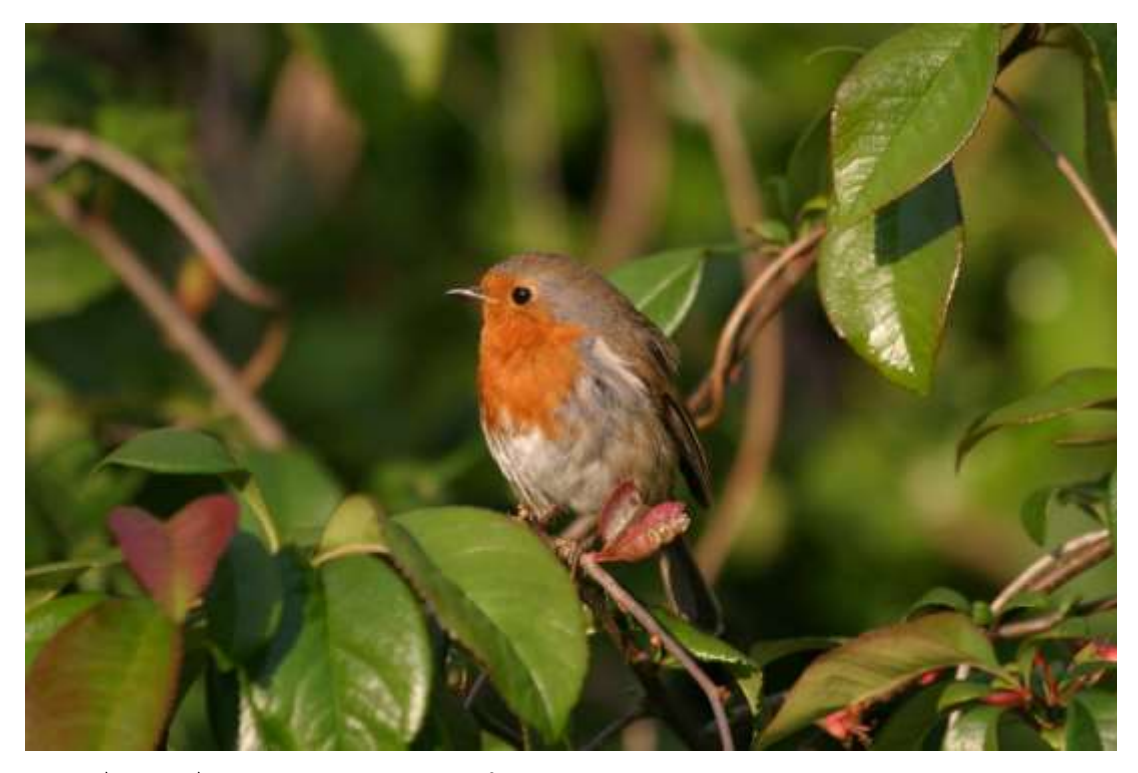
Friendly garden visitor. No prizes for guessing what it is!

Local pubs within very easy reach if anyone fancies a post-walk drink? Or lunch!