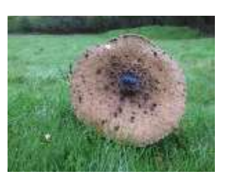
Waxcap, Turkey tail and Parasol fungi at Fingringhoe