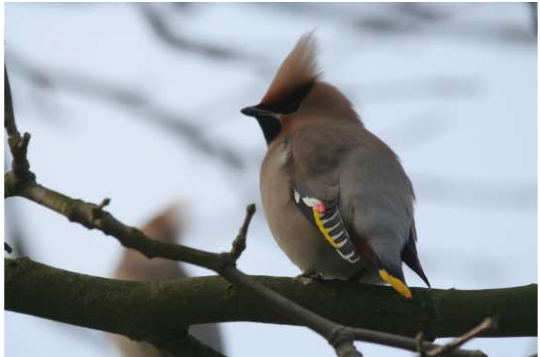
Blackbird posing for the NatureSpy Trailcam in a wildlife-friendly garden in Clacton and Waxwing (note the pink wax on its wing)