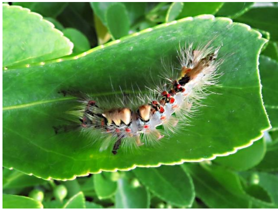
Vapourer moth caterpillar

BRIGHTLINGSEA LIBRARY WILDLIFE GARDEN PROJECT We are delighted to have been asked for input into this exciting project to Rewild the Brightlingsea Library Courtyard. A chance to create habitats for all manner of creatures and to provide an outdoor space for community projects.