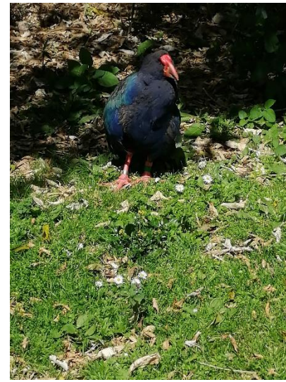
the rare Takahē bird