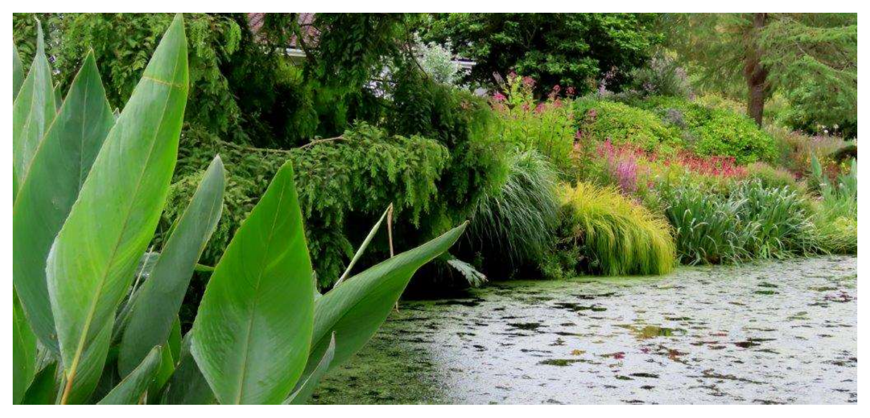
Beth Chatto's garden looking good.....as usual!