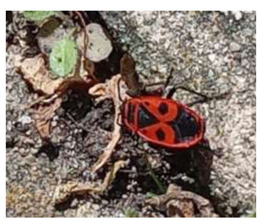
Two of our very distinctive insects - Roesel's Bush Cricket and Firebug