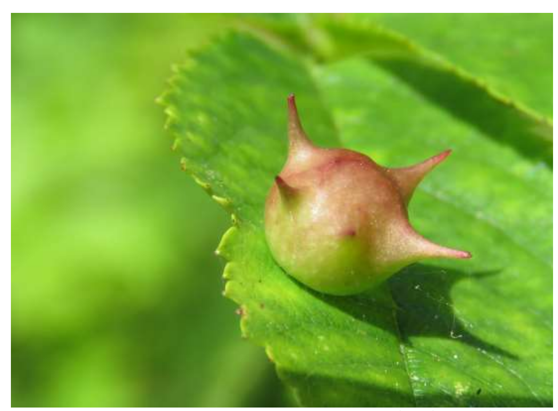
Sputnik Gall. Want to know more? Join us for first of our Zunday Zooms on 1st October. See left for more info and link