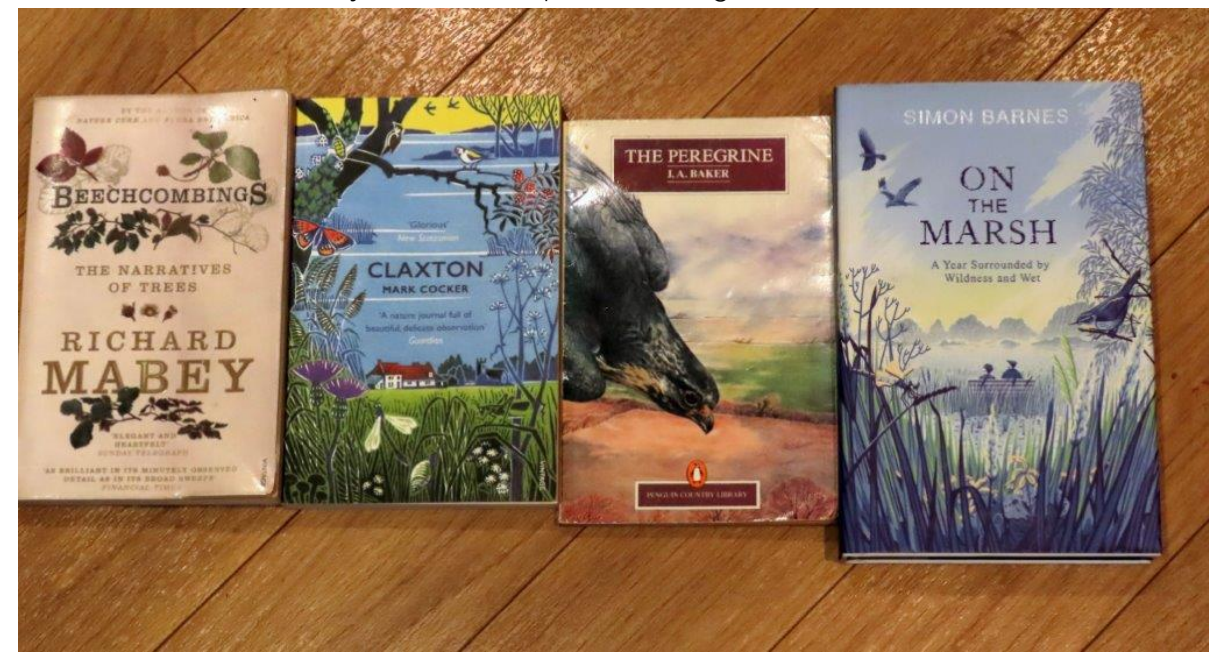
PLEASE KEEP SENDING US YOUR PHOTOS AND NATURE NOTES!

Chris and I have been sorting out our bookshelves and have a few that we no longer need — free to a good home for anyone that is happy to collect from lower Wivenhoe, or a mutually convenient place. Just get in touch.