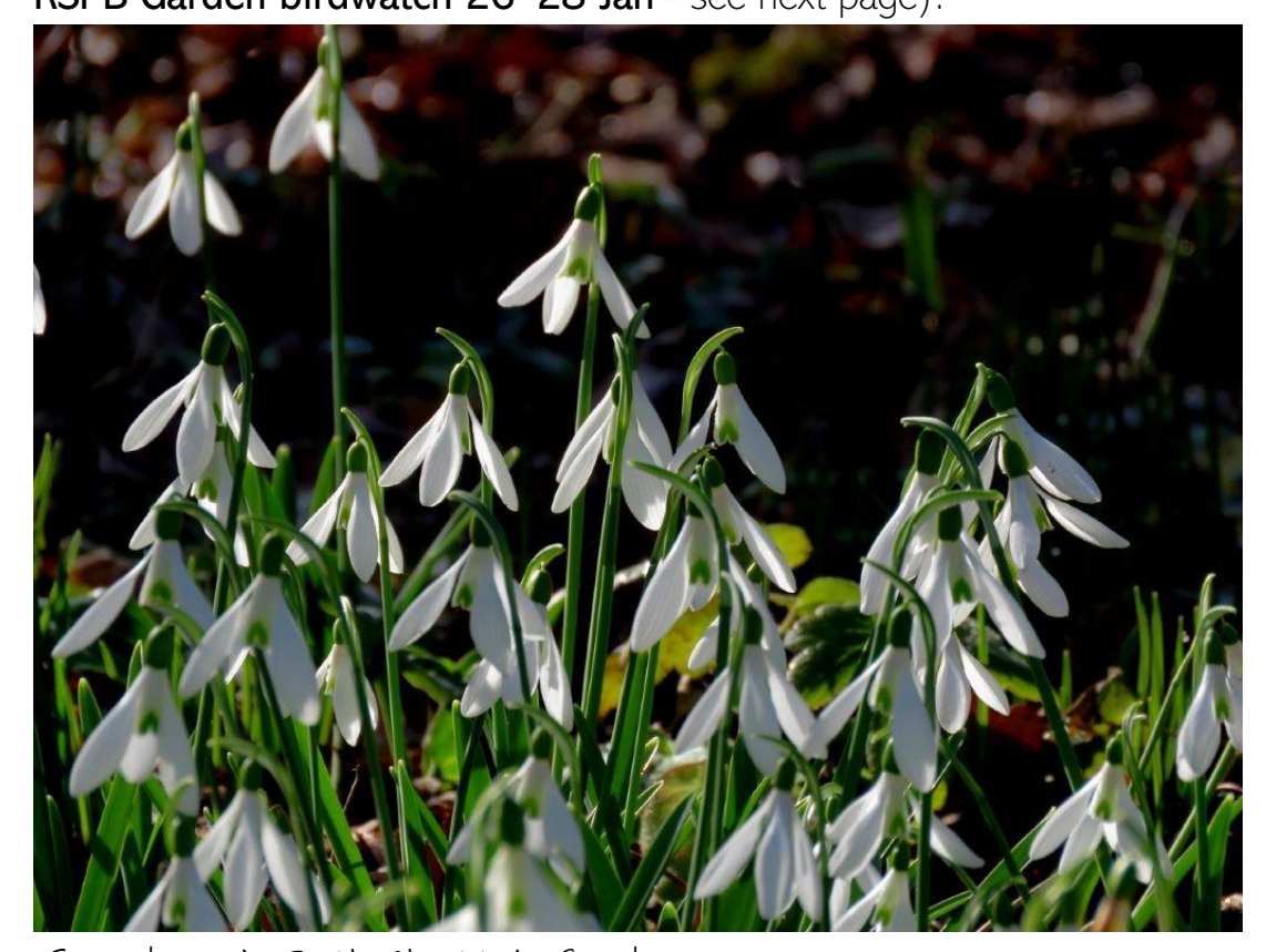
Snowdrops in Beth Chatto's Garden

Hope that 2024 has got off to a good start for you! Each month we will be keeping you up to date with our forthcoming events through our newsletter, and on Whatsapp. We will also be showing some of the photos you have sent in, as well as letting you know about citizen science projects you can be involved in (eg RSPB Garden birdwatch 26–28 Jan - see next page).