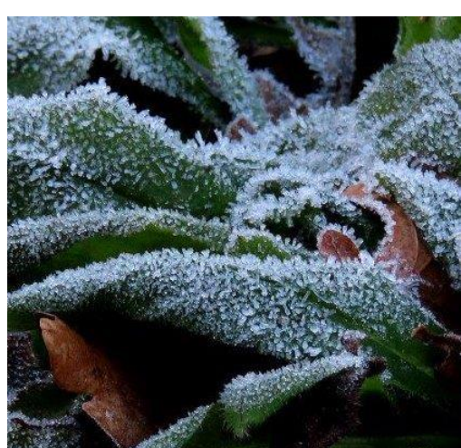
This month has seem to changeable weather – from crisp and frosty mornings...