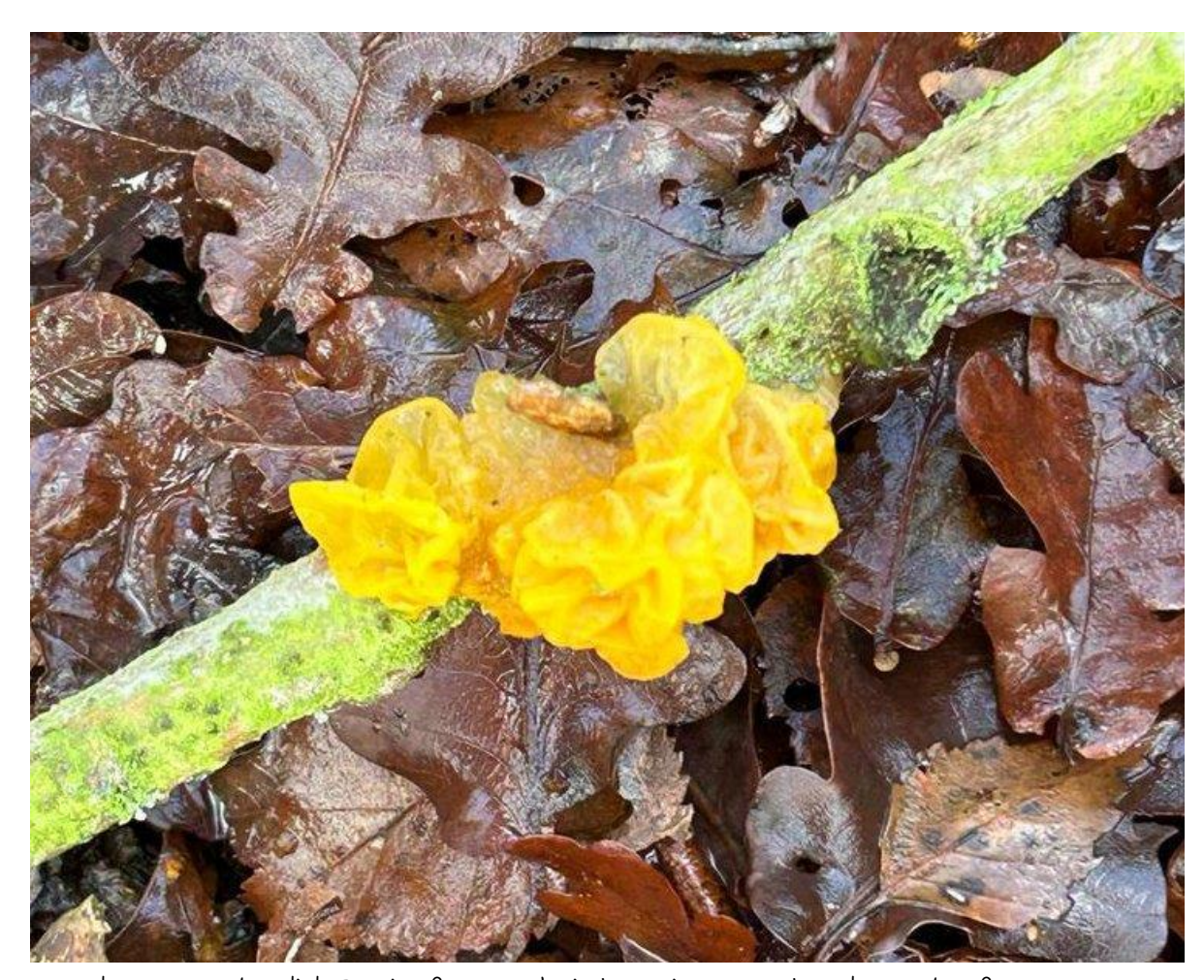
...and some splendid Brain fungus brightening up the damp leafy undergrowth in a wonderful local little wood.