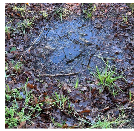
....to torrential rain which affected so many – see here flooding in a Suffolk town and in a local garden. We had our fair share of water-issues in the roof of our flat \Theta .