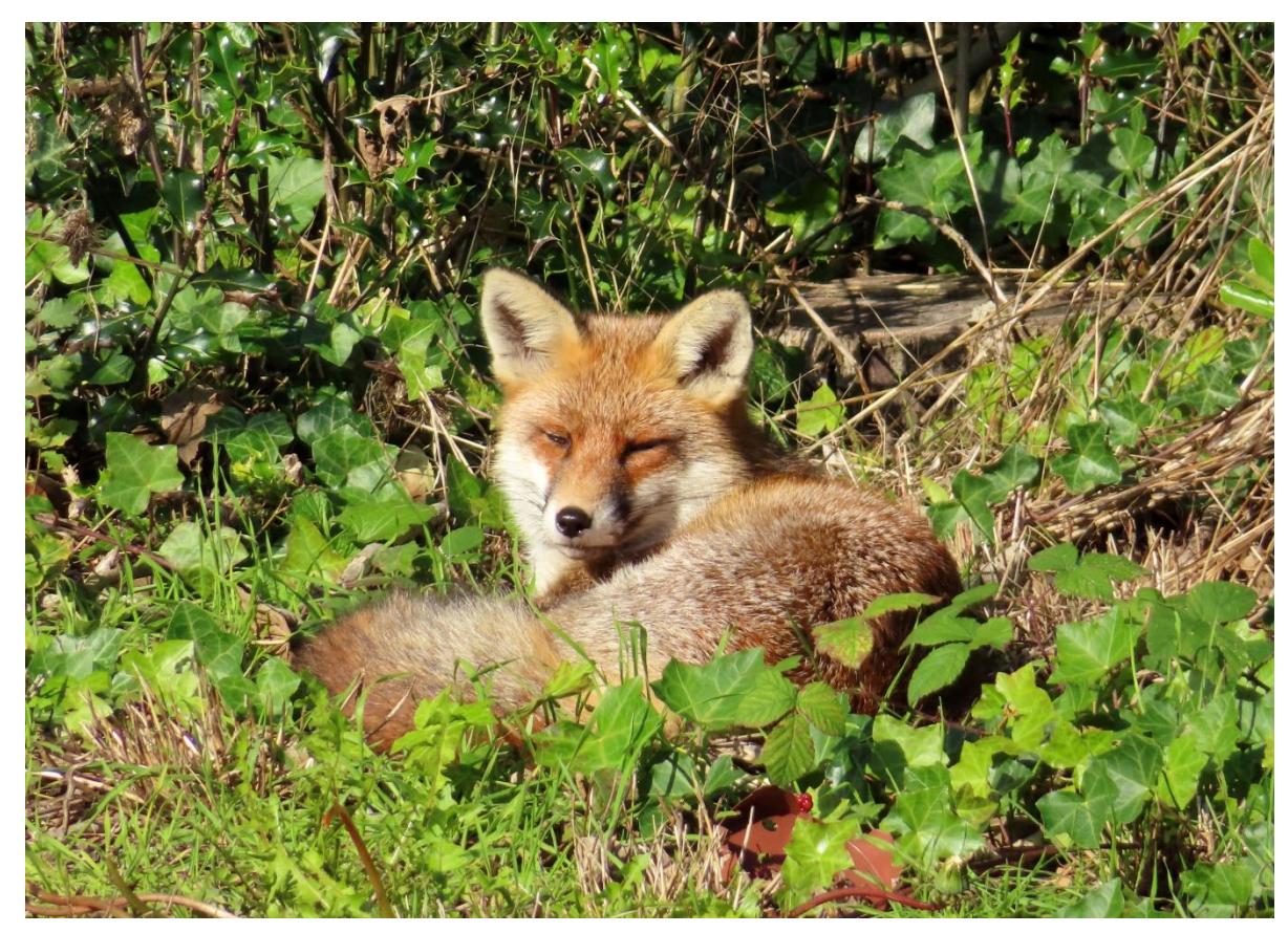
Gorgeous fox enjoying the sunshine...

Thanks to everyone for your contributions this month.