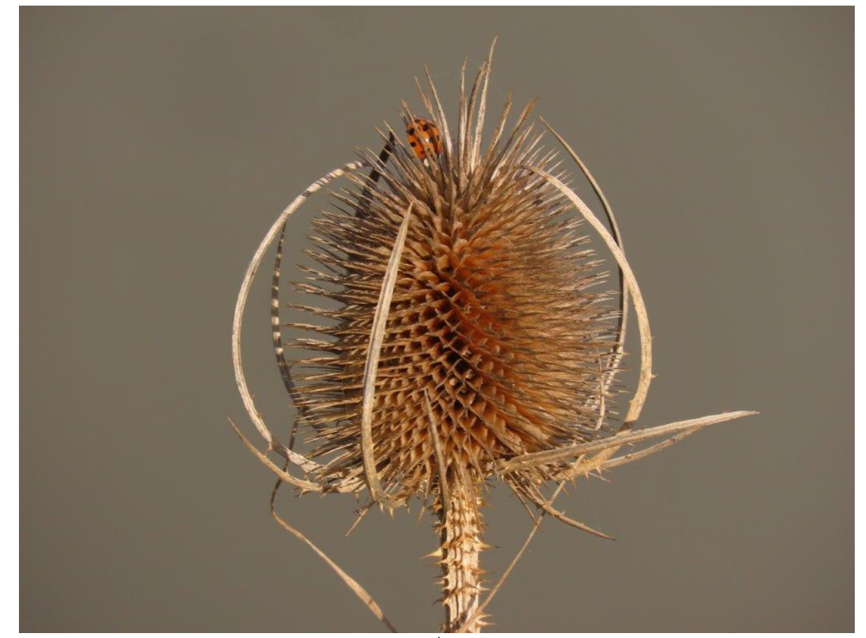
A statuesque Teasel ...and spot the Harlequin Ladybird too! Teasels are both beautiful and prolific providers of seeds - so important for finches.