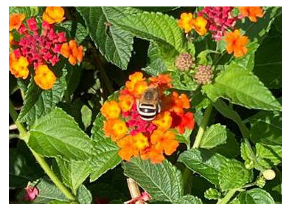
A reminder of warmth and sun! This White Banded Mining Bee on Lantana in Crete.

Thanks to everyone for your contributions this month.