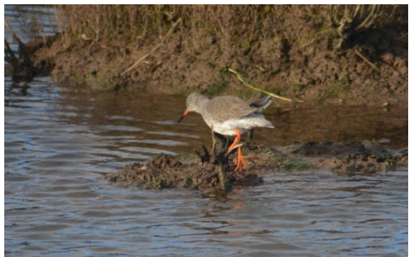
Birds from Norfolk - Redshank and Blacktailed Godwit