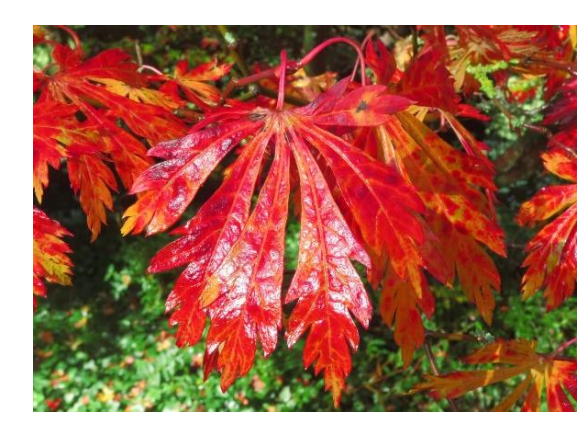
Gorgeous Autumn colours