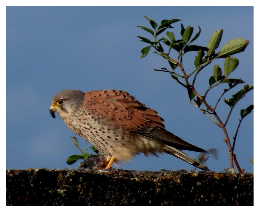
Male Kestrel enjoying lunch at Walton on the Naze