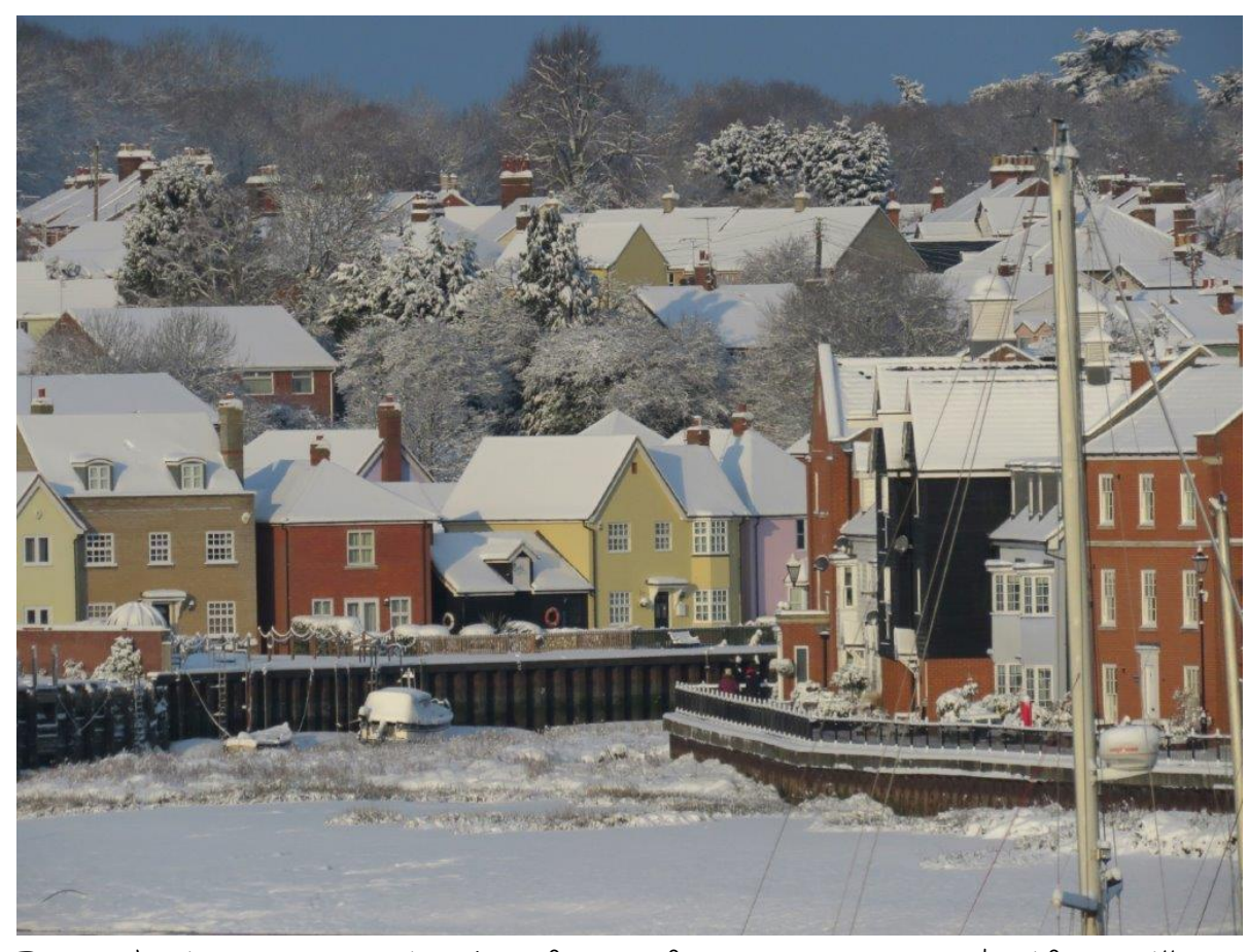
Remembering a snowy Wivenhoe from a few years ago! Wonder if we will see a repetition this winter?

Looking forward to being in touch with the first newsletter of 2024, primarily a listing of events proposed for the year, at the very beginning of January. Please feel free to keep in touch 'til then!