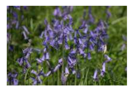
SUNDAY 5^{TH} MAY Start time TBC (prob around 4.30 am) for a couple of hours or so. Only a few spaces left.

BLUEBELL WALK – WIVENHOE WOODS Come and see the stunning display of bluebells and other woodland flora, and learn about their ecology.