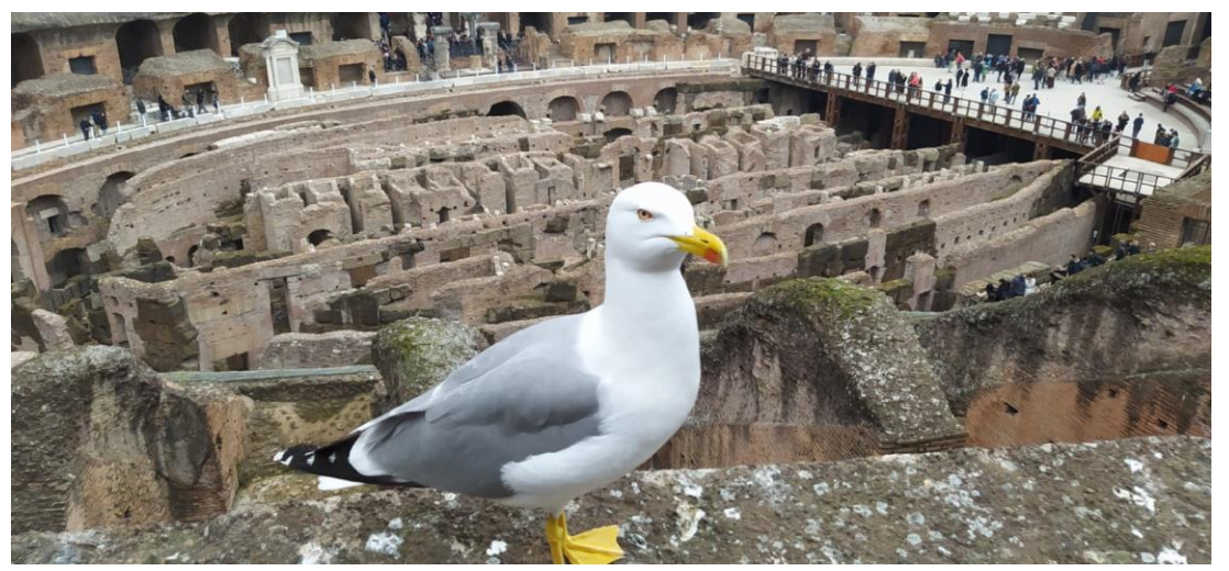
Ciao! Rather impressive Yellow-legged Gull enjoying the sights of the Colosseum