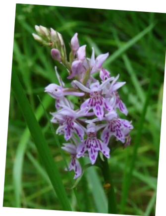
Common Spotted Orchid